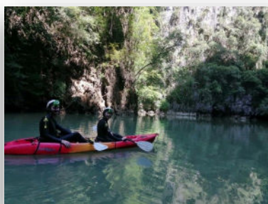
Encourage guest to visit the village; offering a unique destination