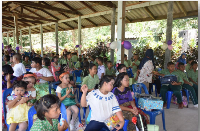
Participate in community activities

Use of local products/souvenirs that are available locally (support income for local community) and ensure that all products/souvenirs are not a product from forest and sea.