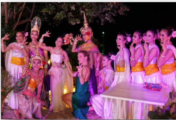
Hiring local contractors and talents

We are committed to investing in the communities where we do business. Our resort collectively focus on these areas of local giving: recruitment of local residents, purchase local products and service, support local economy, contribution to raise environmental awareness with local community, participate in community activities to improve the wellbeing of its people.